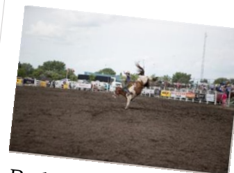
Rodeo Arena Sponsor